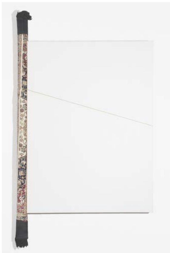
RENATO RANALDI Fuoriquadro , 2011 Linen, copper and carpet cm 200 x 100