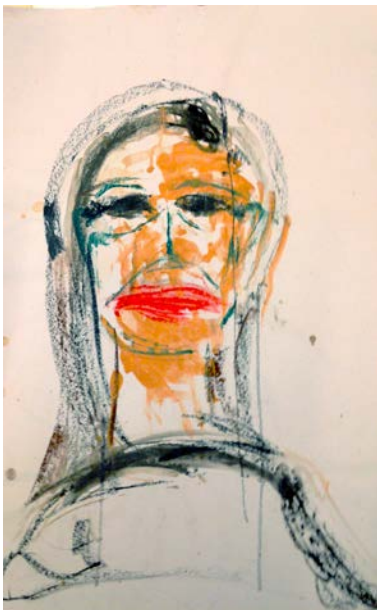
CLAUDIA PISCITELLI « Paola », 2016 charcoal, pastels, ink on paper CM 73 x 60