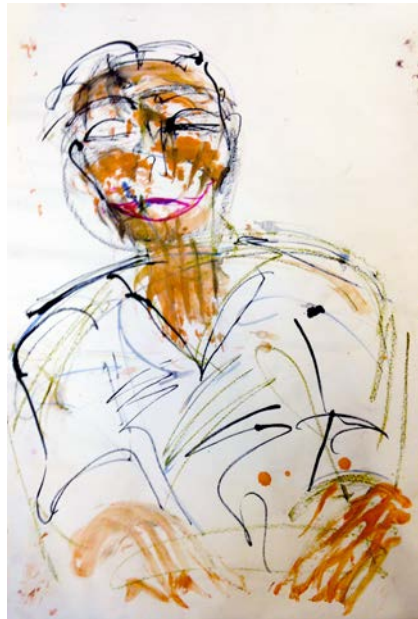
CLAUDIA PISCITELLI « Howtan », 2016 charcoal, pastels, ink on paper CM 88 x 60