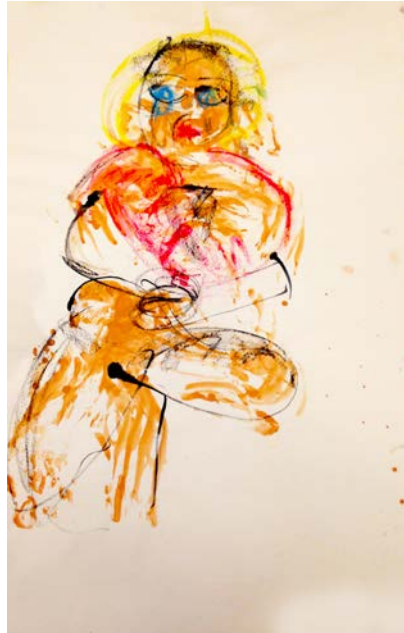
CLAUDIA PISCITELLI « Elaineintera », 2015 charcoal, pastels, ink on paper CM 90 x 60