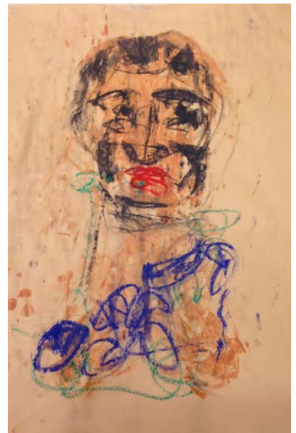
CLAUDIA PISCITELLI « Margherita », 2016 charcoal, pastels, ink on paper CM 68 x 50