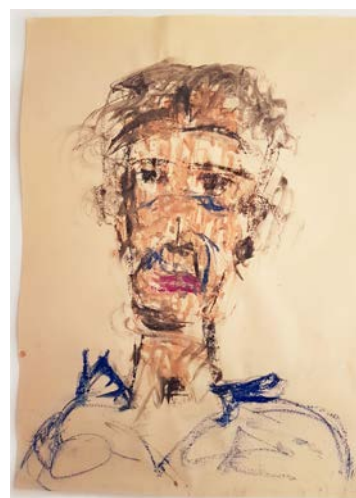
CLAUDIA PISCITELLI « Vittorio », 2016 charcoal, pastels, ink on paper CM 69 x 50