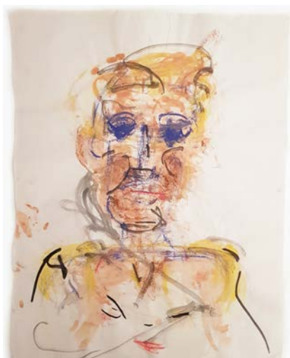
CLAUDIA PISCITELLI « Alessandra », 2016 charcoal, pastels, ink on paper CM 60 x 47

They agree to connect at a deeper level and to open themselves, they usually choose their favorite music during the process so that the artist can represent what she feels as their soul.