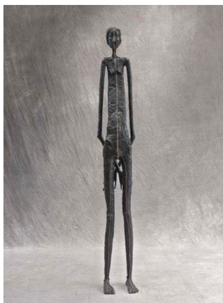
Elle , 2011 Bronze Cm 220 x 52 x 35 1/3