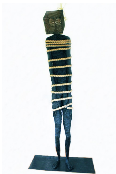
Lui , 2017 Bronze, fer H :Cm 220

By revealing the chains that imprison our bodies and thought, the artist helps us liberate ourselves. She gives us back our freedom to be. Elle , the woman whose body and face are closed by a zipper, waits in silence for the one who will know how to unzip her to restore her to herself.